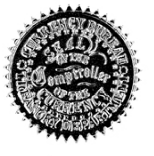
Comptroller of the Currency